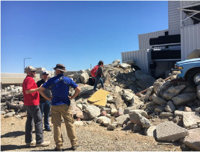
JIFX Staff work with Teledyne Experimenters to place "patients" in the rubble pile at the CACTF

As with all JIFX events, the Naval Postgraduate School staff brought together many of the experiments in around a common integrating scenario on Thursday morning. Approached as a contextual framework, the scenario was not designed to address a specific mission need, rather to provide an informal way for different technologies to explore their capability within a common setting. The integrated scenario consisted of a major event in which patients needed to be identified and tracked in a significantly damaged area. UAV technology from Carnegie Mellon University, Lockheed Martin, and Teledyne was used to discover individuals in the field, and the UAV's worked in conjunction with a response team from I Marine Expeditionary Force to track and triage the patients. Once individuals were located in the field, the Army Research Lab, Southwest Synergistic Solutions, Swerve Logic, and Orion Labs, compiled the data and sent it to a situational awareness command center. Lasting almost two hours, the integrated scenario allowed experimenters and military operators hands-on interaction and produced a variety of suggestions for improvement and suggestions for further exploration.