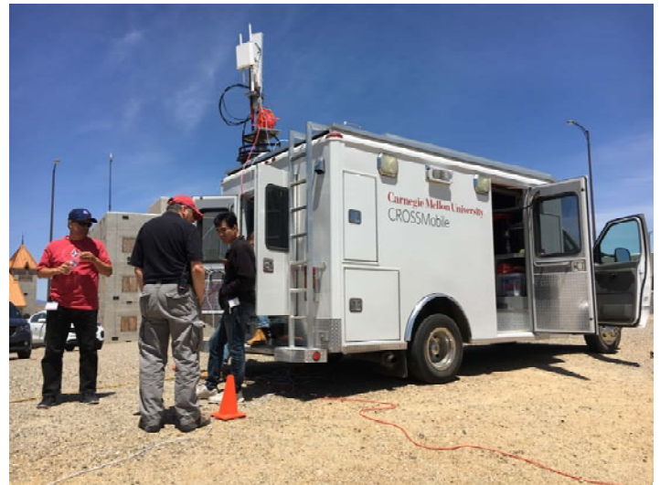
Carnegie Mellon University staff and students next to their "CrossMobile" - an ambulance converted into an innovative mobile lab

Carnegie Mellon University Silicon Valley (CMU) continued their experimentation into machine learning on board small UAVs. Using a single-board computer on a light quad rotor, they were able to train the UAV to recognize a wide variety of different targets, from color-coded cell phone screens to individuals in a crowd. All of the learning and feature detection algorithms run completely on the UAV learning while in flight. An additional CMU experiment paired this learning on-board AI with a wearable EKG device, allowing the UAV to respond to increases in the stress level of a warfighter on patrol, autonomously fly to and then follow the warfighter. CMU also tested the prototype of their Virtual Image Processing for Research (VIPR) project, creating a hardware-in-the-loop, faster-than-real-time learning environment for autonomous systems.