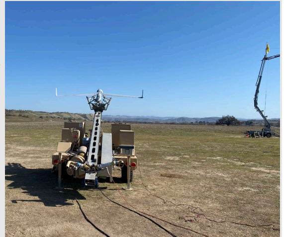
ScanEagle preparing for launch

A series of long duration flights evaluated Scan Eagle ISR capabilities to collect and transmit video and telemetry data. The first day's flight transmitted 7 GB of network traffic, including synchronized video and telemetry from the aircraft's sensors. That dataset will enable further research in visual navigation methods. The second day's flight successfully established internet connectivity between the platform's ground control station and the COPERS situational awareness system which enabled the system's participation in the multi-domain experiment. During that experiment the sensors collected an additional 6 GB of network data and successfully transmitted cursor-on-target (CoT) data through a commercial mesh network to COPERS making that data observable to experimenters distributed across the country. The team measured a data throughput of 5-9 Mbps across MANET into the Internet proving the technical feasibility of transmitting video as well as CoT to COPERS in future C2 experiments.