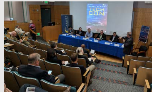
PANEL 2: The Entrepreneurs