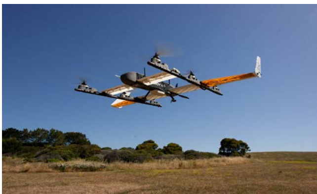
Elroy Air VTOL Aerial ULS: Sub-Scale Aircraft at JIFX 18-4, February 2019

“NPS, with its emphasis on applied research, is a place where this magic can thrive due to the proximity of warfighters, operators, researchers and industry.”