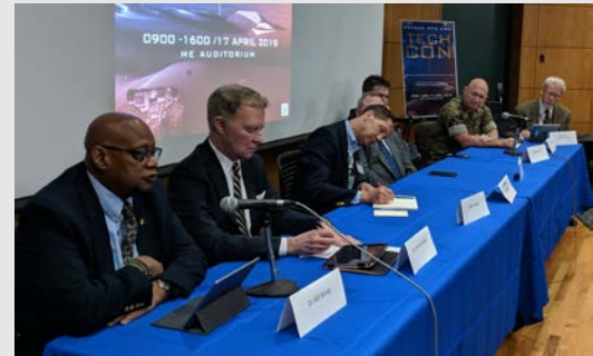
PANEL 1: Government Innovators