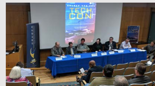
PANEL 3: NPS Research with Industry